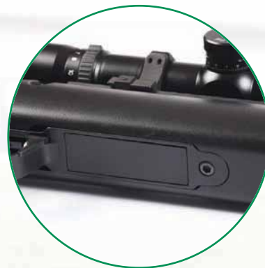
Showing 3 round magazine fitted