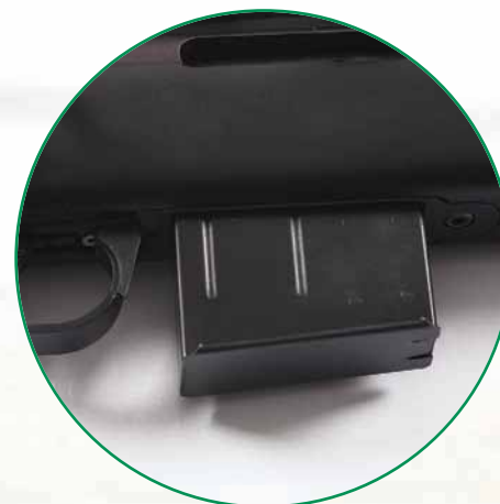
10 round magazine showing magazine release catch open