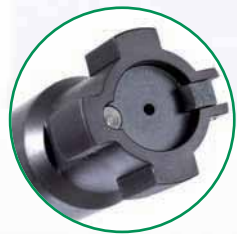
Quadlite® bolt face