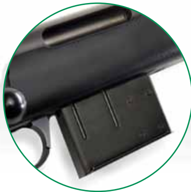
Optional 10 Round Magazine