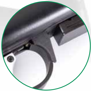
Magazine Release Catch