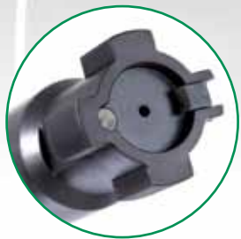
Quadlite® Bolt Face