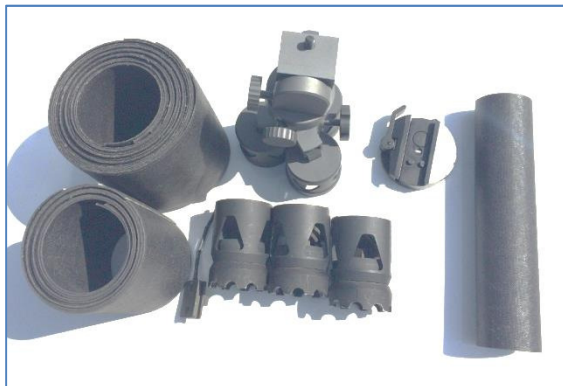
The Standard Tripod Kit with the Optional 1.5 mtr legs : Weighs 4.5 lbs