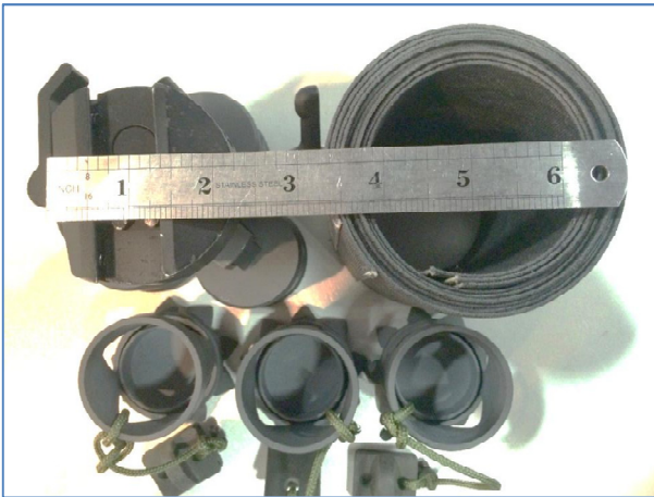
The Standard Tripod Kit: Weighs 2.25 lbs