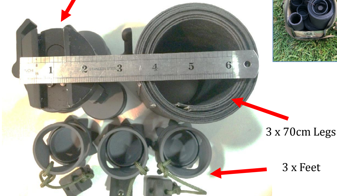
3 x 70cm Legs